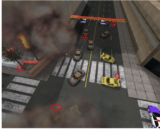
(c) Outdoor area of CompWorldDay1 , as soon through the camera of the AirRobot. Victim locations are indicated by red circles.