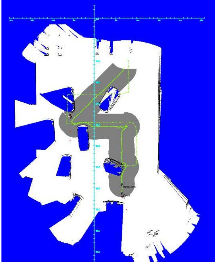
Fig. 3. Map generated by the ground robot in the outdoor area of CompWorldDay1

RFID tags with only an ID always present in the 2006 competition world 3 . Only near the male and female victim RFID tags are dropped by the AirRobot.