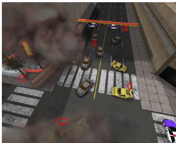
(c) Outdoor area of CompWorldDay1 , as seen through the camera of the AirRobot. Victim locations are indicated by red circles.