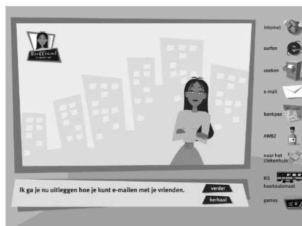
Figure 3. Screen agent Steffie

Steffie is a screen agent designed in Flash and developed as a part of a website (www.steffie.nl) where she features as a talking guide, explaining the internet, e-mail, health insurance, cash dispensers and railway ticket machines.