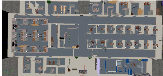
Fig. 1.1. A blue-print of the Hotel Arena, the virtual environment used for our experiments.

Our experiments will be based on the 'Hotel Arena' that was used extensively during the RoboCup Rescue competitions of 2006 1 . Figure 1.1 shows a blue-print of this office-like environment. The wide vertical corridor in the center connects the lobby in the south with several horizontal corridors that go east and west. Numerous rooms border on all the corridors. For the competition runs, robots would typically be spawned in the lobby or at the far ends of corridors, e.g. in the north-east, north-west or south-east corners.